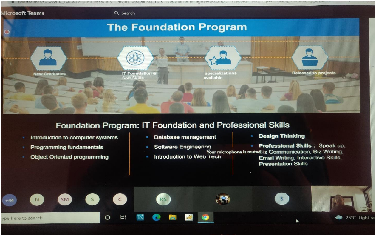
Fig 1: Foundation Program – IT Foundation and Professional Skills